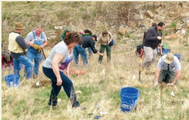
More than 60 boy scouts participated in the planting at SBR on April 19.