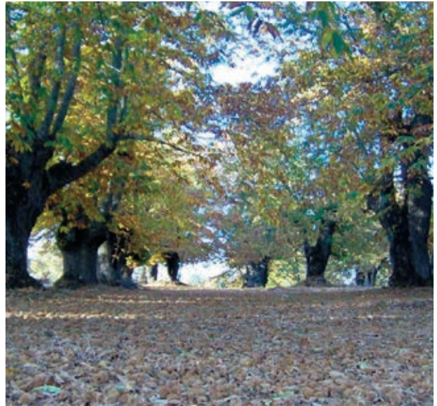
Old chestnut trees in a traditional fruit orchard ( souto ).

robur ). Consequently, these different cultural approaches provide different chestnut forest types and products that require appropriate management models.