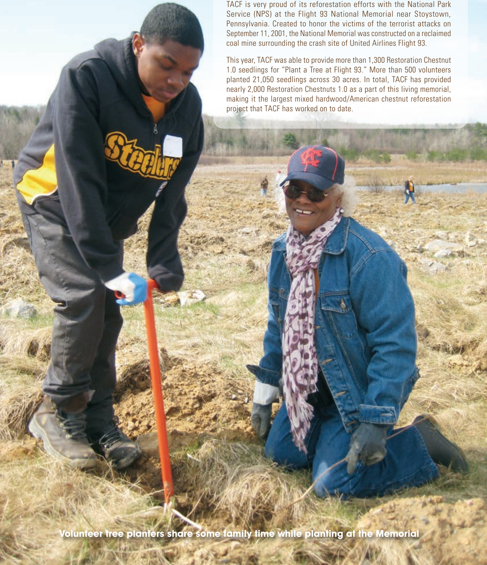
Volunteer tree planters share some family time while planting at the Memorial

This year, TACF was able to provide more than 1,300 Restoration Chestnut 1.0 seedlings for "Plant a Tree at Flight 93." More than 500 volunteers planted 21,050 seedlings across 30 acres. In total, TACF has provided nearly 2,000 Restoration Chestnuts 1.0 as a part of this living memorial, making it the largest mixed hardwood/American chestnut reforestation project that TACF has worked on to date.