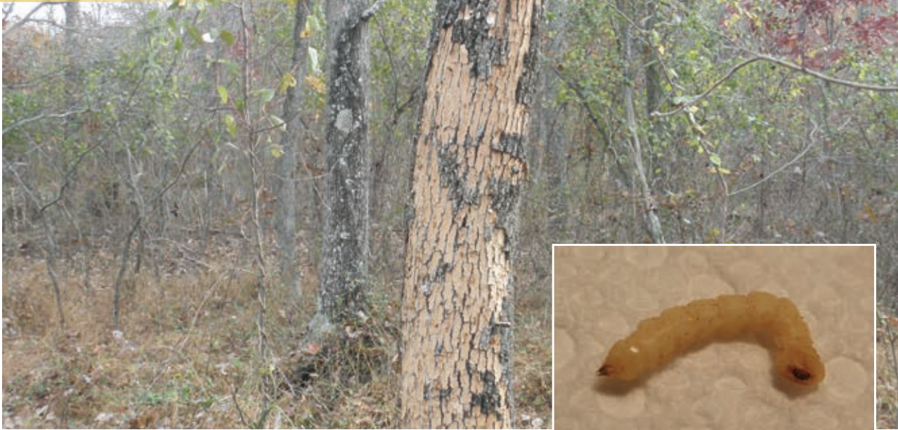
This white ash tree shows typical, dramatic bark damage caused by woodpeckers, in search of EAB larvae beneath the bark, in Morgan County, WV.