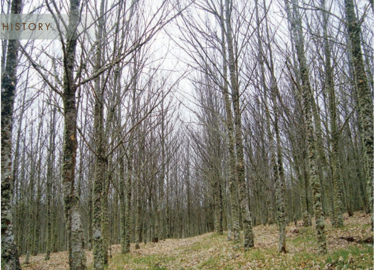
Young chestnut tree plantation for timber production.

limit its spread are still being developed. The female gall wasp lays eggs in the buds of chestnut trees in early summer (May/June) and their growth begins the following spring, when the tree buds begin to develop. At this point in the life cycle, the larvae induce the formation of galls on the leaf buds, which can be very damaging to the tree. They occur on the new growth, disrupting the fruiting process, and can reduce the tree yield up to 70% and, in some instances, can cause mortality, particularly if the trees are stressed by drought or other site factors. It is estimated that this pest has the potential to cause 40 million in damages to Portuguese chestnut production. Control measures include pruning infested buds on trees. Pesticides are generally not effective because the insects take cover inside the galls. The most successful gall wasp control method is the introduction of the Torymus sinensis wasp. This parasitoid has proved effective as an agent of biological pest control against the gall wasp in Japan. Ongoing research in Portugal will determine the feasibility of its release into infected regions.