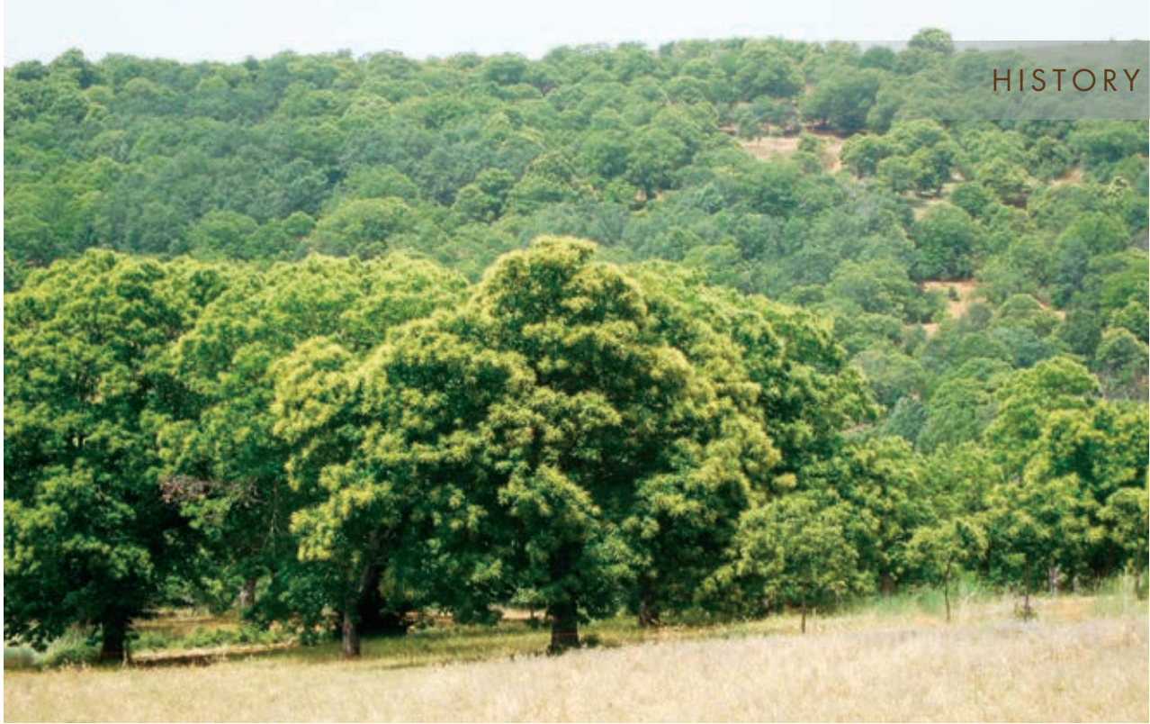
Landscape with chestnut trees at Montesinho Natural Park.