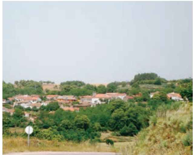
Chestnut trees around a small mountain village in Trás-os-Montes.

In general, there are three major typologies applied in the cultivation of chestnut: (1) souto (grafted trees for nut production with traditional cultivars in an agroforestry system), (2) “low forest” or coppice culture (production from shoots of dormant or adventitious stump buds), and (3) castiçal , “high forest” planted or natural regeneration originating directly from seed or seedlings for large dimension roundwood production. Chestnut is usually grown in pure stands, but it can grow in mixed stands in closed forests with the maritime or cluster pine ( Pinus pinaster ), and oaks, such as Pyrenean oak ( Quercus pyrenaica ) and pedunculate oak ( Quercus