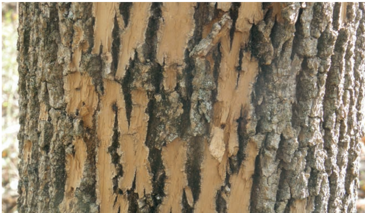
"D" shaped exit holes on the tree show evident adult Beetle damage.

Officials in Michigan battled to stop the movement of firewood. A quarantine was instituted in 2002, with fines for moving ash trees or wood. The public was blitzed with billboards and public service announcements,