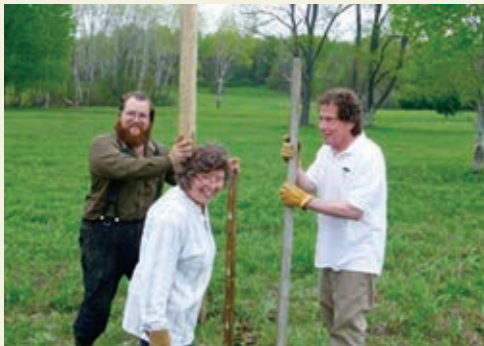
Pittsfield's Spring Side Park deer farm work in progress.